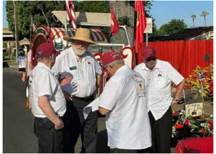
The boys checking the map for the closest comfort station after breakfast from Denny's.