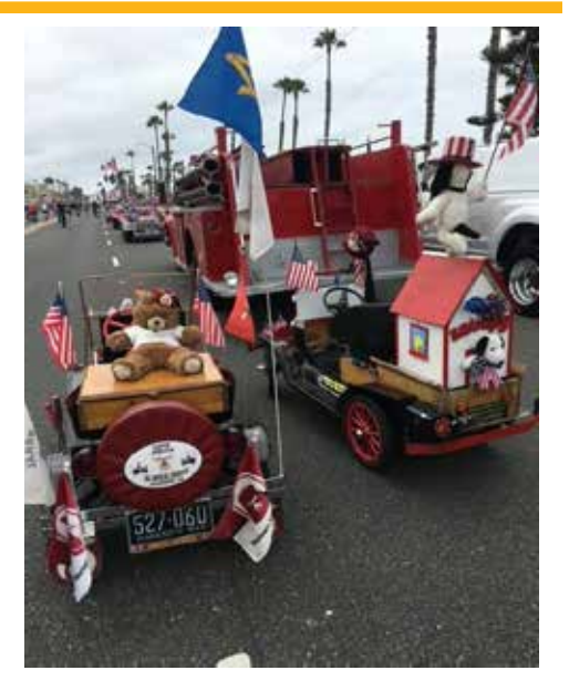
The world famous Snoopy Tin Lizzie

El Bekal Shrine has good PR on this televised parade.