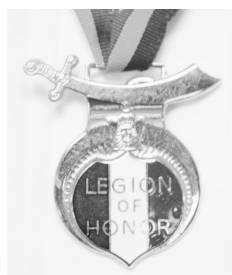
Legion of Honor Past Masters